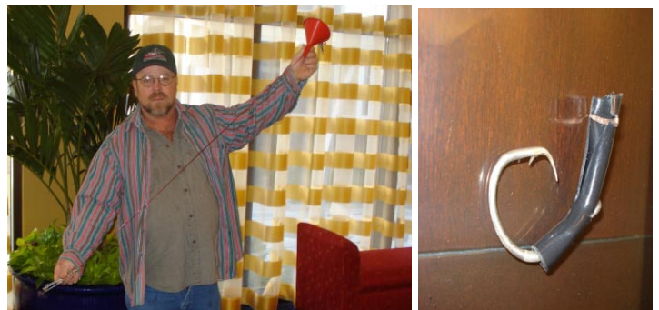
Examples of industry proposed gear modifications for the bottom longline fishery

The meetings are part of the initial phase of preparing a plan amendment and are designed to identify issues and a reasonable range of alternatives to address those issues. Some alternatives that may be considered include time/area closures, gear modifications, effort limitation, and other measures to reduce sea turtle takes and mortality from interactions with bottom longline gear in the reef fish fishery. The public is encouraged to attend and provide comments and suggestions; public input will then be used to further develop the amendment.